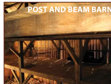
POST AND BEAM BARN

The lumber industry is the original "Green" industry. Our sawdust is sold to wood pellet companies and made into wood pellets, wood chips are sold to power plants and schools, the bark becomes that beautiful dark bark mulch used to announce the end of winter! What doesn't end up as lumber, pellets, fuel for power plants and schools, or bark mulch, is used for cordwood. There is virtually no waste here.