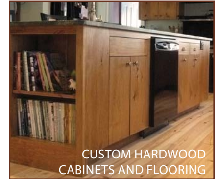
CUSTOM HARDWOOD CABINETS AND FLOORING

In the retail store, customers will find a full line of high quality hardwoods, including northern red oak, hickory, maple, birch, and native pine . NEFP carries flooring, stair parts, standard patterns of white pine (V-match, shiplap, paneling), cabinet grade hardwoods, dimension lumber, softwood planking timbers and more . We also do custom sawing . We specialize in lumber that is native to this region and that has been sustainably harvested.