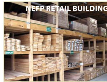
NEFP RETAIL BUILDING