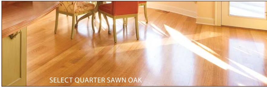
SELECT QUARTER SAWN OAK